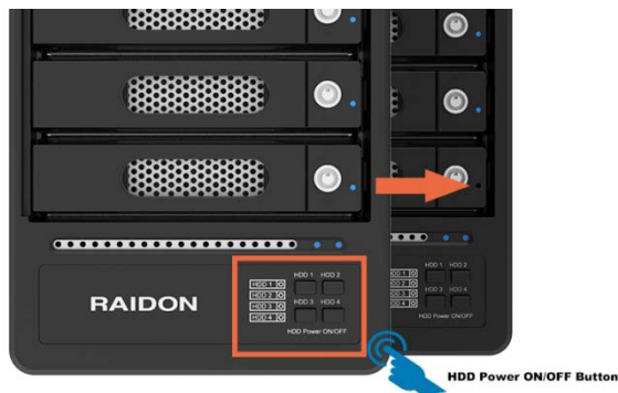
4 hard drive independent power switches

GT5640-B31 provides the independent power switch for each disk, user can power off one or more disks depend on the need to save the power.